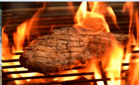
"JAPAN X" Pork Loin