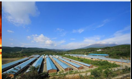
Our main farm