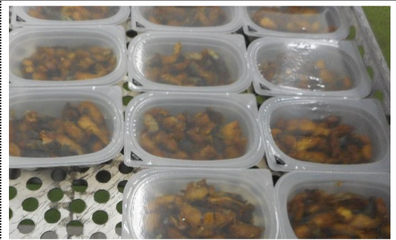
filling(pack in trays)